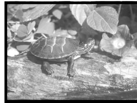
A Young Painted Turtle

May means Aquatic Adventure at Up Yonda Farm! Discover all of the animals that live in and around our pond and learn to identify them. See how the insects, fish, turtles and plants depend on each other in a food chain, as we build a pond together. Students will be around the pond and have an opportunity to handle live aquatic animals, so please dress appropriately.