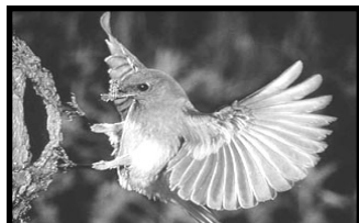
New York's State bird, the Eastern Bluebird

April at Up Yonda Farm is Natural Heritage month. The topics covered include our New York State symbols and their meaning, as well as the natural formation of our state's mountains, lakes and rivers. The program lasts 90 minutes and is most suited for students in grades 3-7.